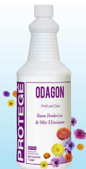
Fresh and Clean